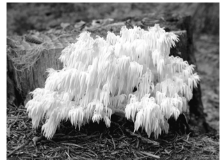
Hericium abietis or pom pom du blanc