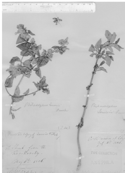
Lewis's collection of Philadelphus lewisii